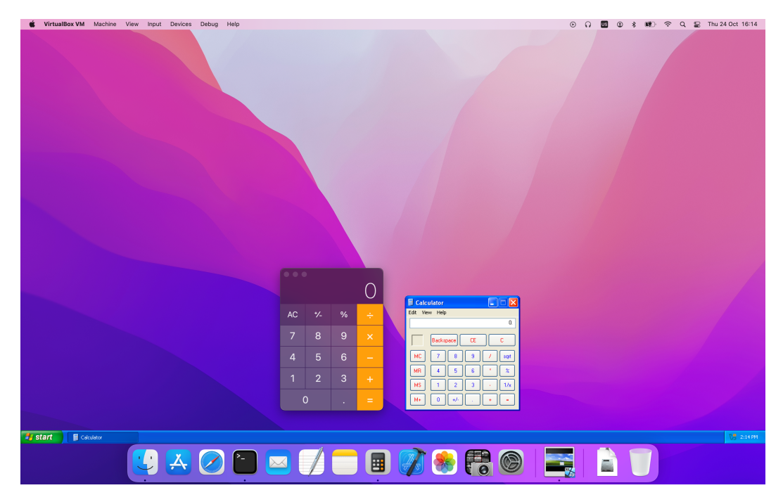
Figure 2: Seamless Windows on a Host Desktop

To enable seamless windows, on the virtual machine, press the Host key + L . The Host key is displayed on the taskbar and is normally the right control key.