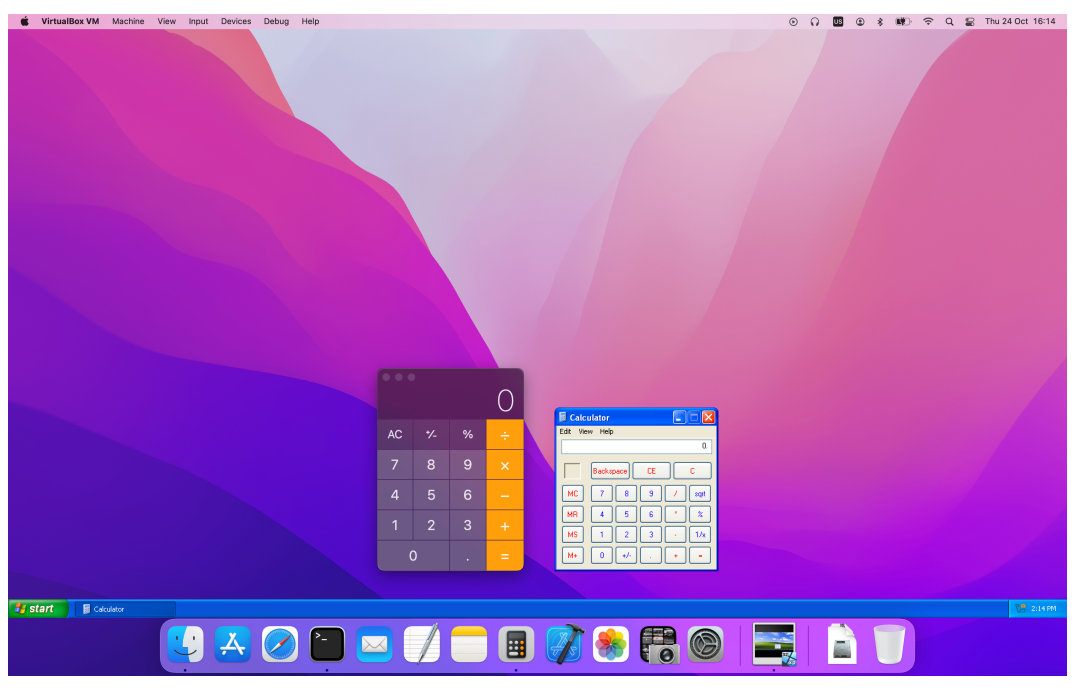
Figure 2: Seamless Windows on a Host Desktop

In Figure 2: Seamless Windows on a Host Desktop on page 126 you can see two calculator applications side by side, one running on the host and the other running on the VM.